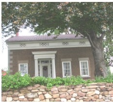
10. J. Whitlock House

This home, built ca. 1835, is separated from the highway by a dry-wall stone wall. The water washed cobbles are mainly grey and brown, and smaller on the front than the sides. The main entrance features a pair of Doric columns and the grilles over the belly windows in the cornice are made of wood, which was unusual. The cut stone are all grey limestone.