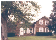
6. William Wilson

The Jesse Smith house was built in 1833 and is known as a Greek Revival style house. Stones for the facing are English cut—stones cut in two with the flat side exposed on the outer wall. They are approximately 4" wide and laid in the same manner as those used in regular cobblestone construction. This home is located on the Maple Road north of Nelson Road.