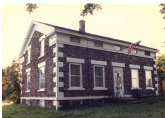
3. Adriance House