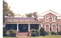
7. James Morse House

The William Wilson house was built in 1861. The facing on the building is laid with English cut stones mortared with limestone. Stones used were hauled by wagon from the Lake Ontario Shore, and when it was completed, it was occupied by two families consisting of 13 people! It is located on the west side of the Maple Road, north of Shadigee Road.