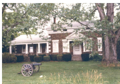
5. Jesse Smith House

This home was built on the North side of the Marsh Settlement Road (now Chestnut Road) in 1836. Stones were brought by wagon from Lake Ontario over trails cut through the woods. It certainly would have been a difficult task when you consider that East Wilson in the 1800's was covered with great swamps and bears and wolves roamed freely!