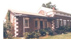
8. Exley House

Built around 1845, the James Morse house features the typical farm house plan of Western New York. Walls are faced with grey and brown cobblestones, and the cornice is Greek Revival. Windows are capped with stone-label moldings fashioned at Lockport in English Gothic Style.