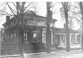
11. Wilson House

This home, built ca. 1835, is separated from the highway by a dry-wall stone wall. The water washed cobbles are mainly grey and brown, and smaller on the front than the sides. The main entrance features a pair of Doric columns and the grilles over the belly windows in the cornice are made of wood, which was unusual. The cut stone are all grey limestone.