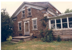
2. Aiken House