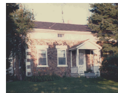
9. Clinton Pettit House